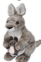
Keep on trying Kangaroo