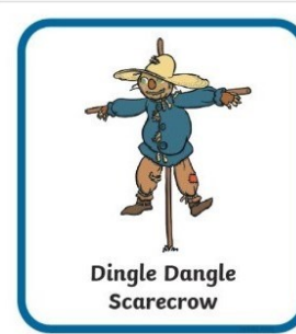
Dingle Dangle Scarecrow